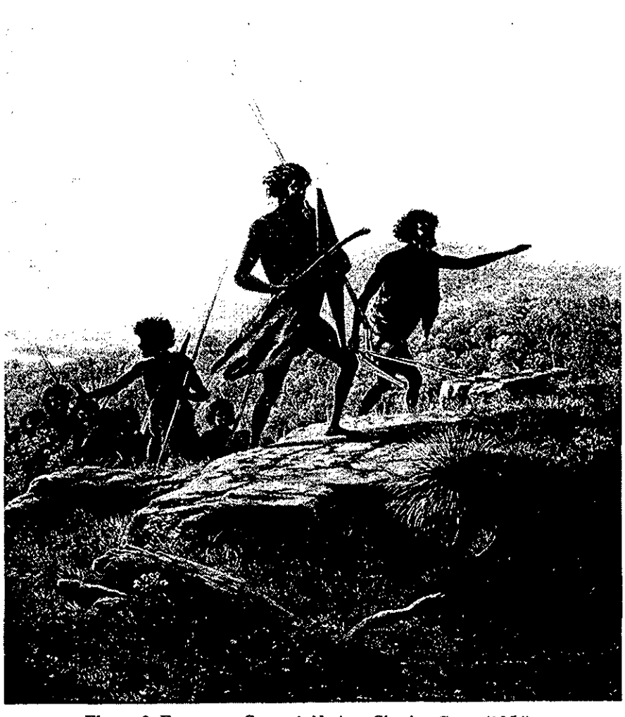
Figure 2: Eugen von Guerard, Natives Chasing Game (1854).

Queensland. Under a variety of names and institutional guises, Aborigines were then "protected" (or, as the wags put it, colonists were protected from them) by means of a series of institutionalised inducements which were provided on stations and reserves set aside for the purpose (Christie 1979:81-106).