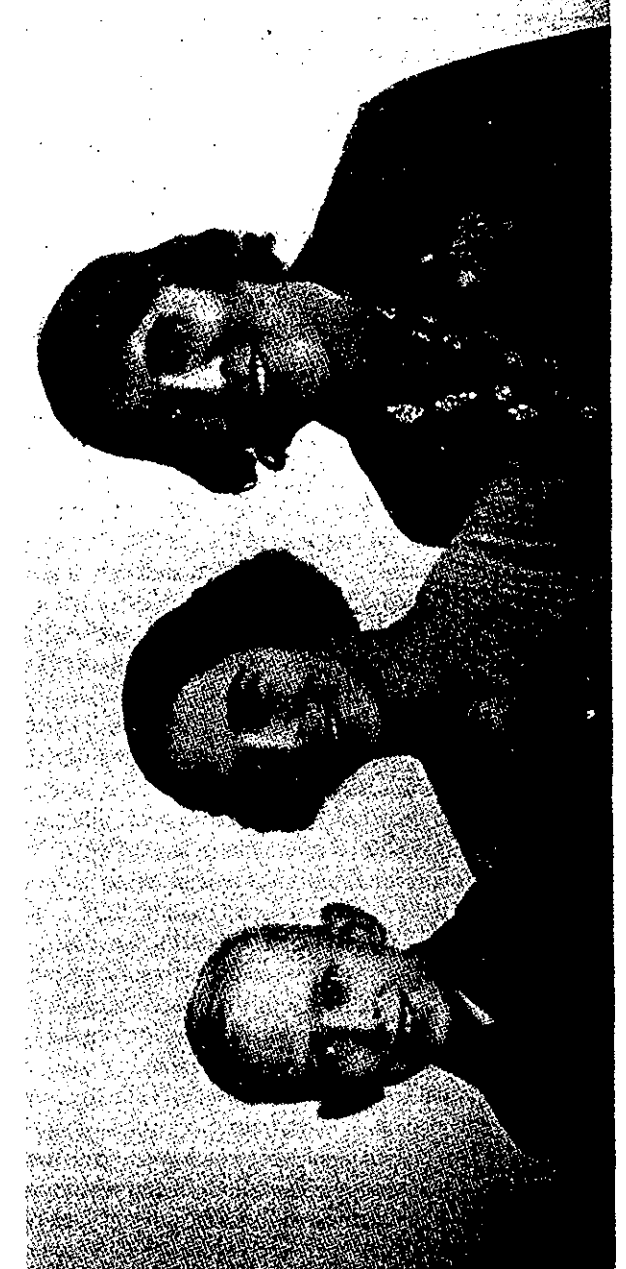
THREE GENERATIONS (Reading from Right to Left)

Despite appearances, genetic arithmetic was not a measure of static racial proportions. Rather, it was a colour-coded lap count along the course of elimination. This course lasted three generations (Fig. 3), respectively termed "half-caste", "quadroon" and "octoroon", there being no fourth-generational, one-sixteenth category. Beyond octoroon, therefore, one had been bred White, a condition officially vouchsafed by scientifically-couched assurances that Aboriginal genes were not liable to produce atavistic throwbacks in subsequent generations.<sup>35</sup> With each succeeding generation, then, this spectrum of bodily markings provided for the anomalous Aboriginality to be halved as a result of the sexual activities of White men. Thus