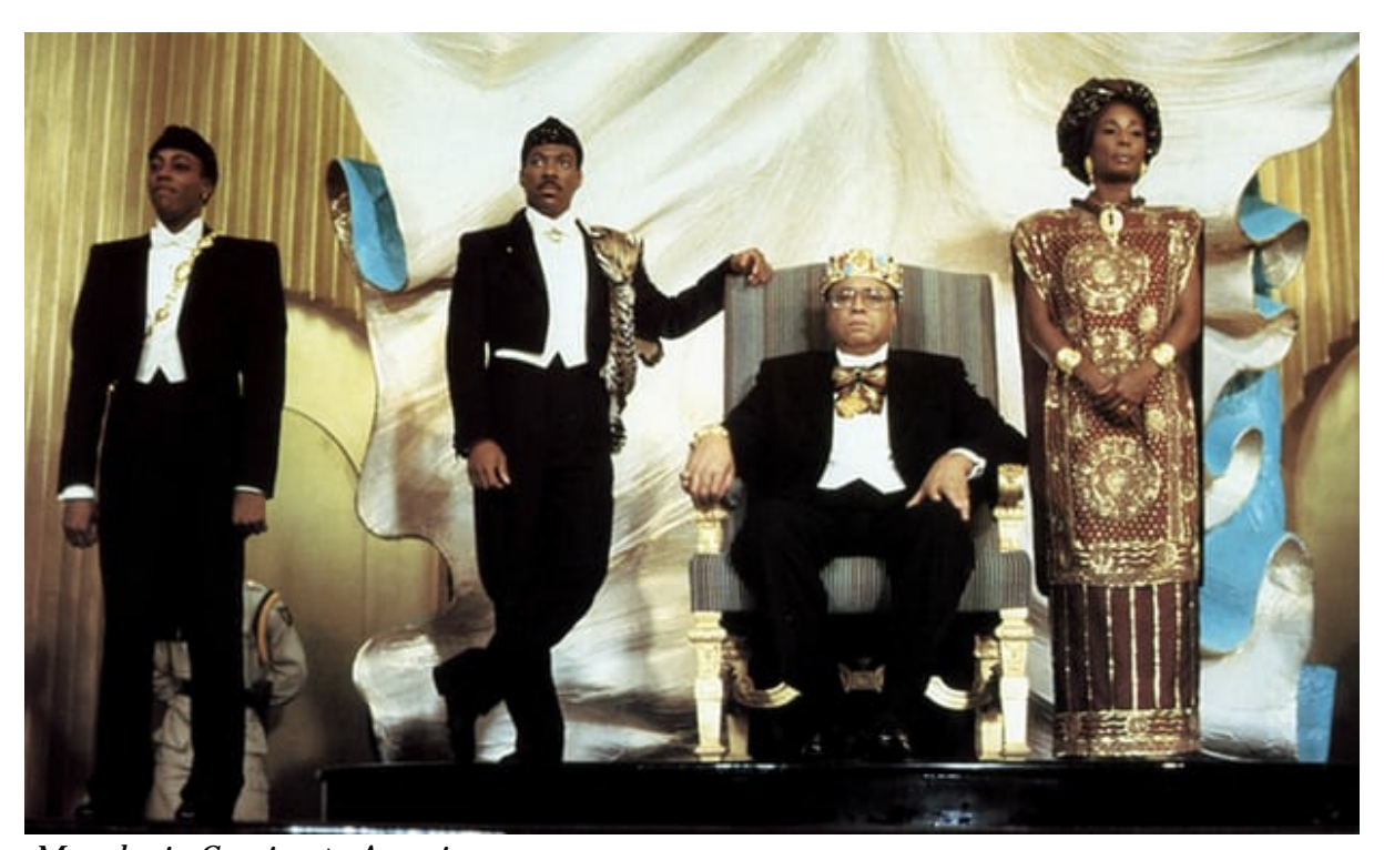
Murphy in Coming to America.