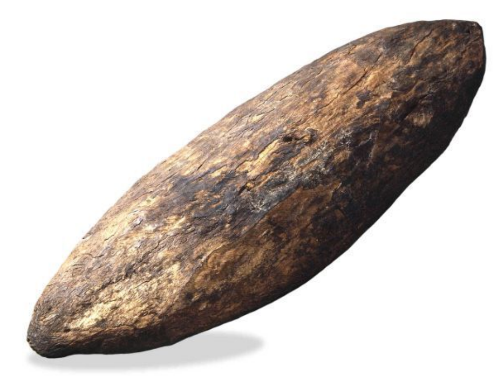
PHOTO: A shield collected at Botany Bay during Captain Cook's visit in 1770. (Supplied: British Museum)

A shield collected after a skirmish at Botany Bay in 1770 is set to go on display at the British Museum as part of an "immensely important" exhibition devoted to the history of Indigenous Australia.