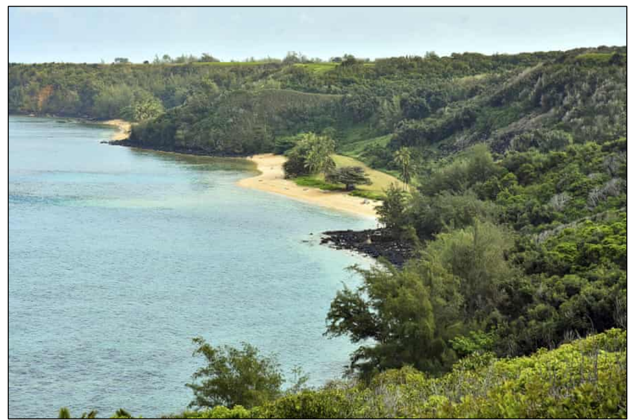
Pila'a Beach, center, shown in 2017, sits below hillside and ridgetop land owned by Facebook CEO Mark Zuckerberg on the north shore of Kauai in Hawaii.

Zuckerberg's massive estate has met with criticism and controversy in the past. In 2016, Zuckerberg angered neighbors when he constructed a 6ft stone wall around his property that blocked easy access to Pila'a Beach, in an attempt to decrease highway and road noise.